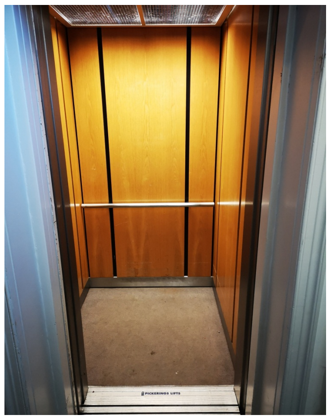
Interior of the lift