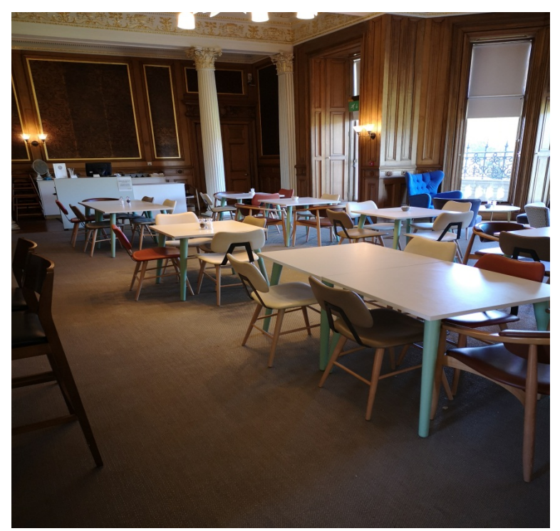
Dining area in the tearoom