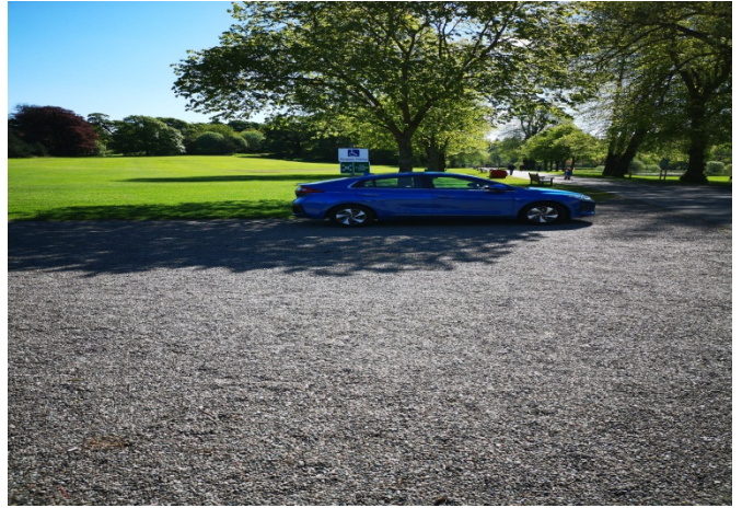
Disabled parking area