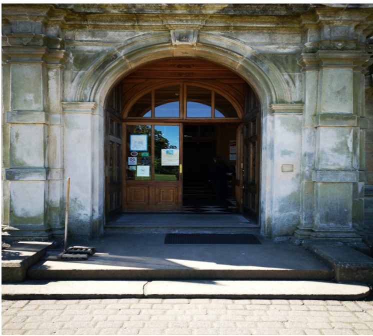
View of our main entrance from Callendar Park