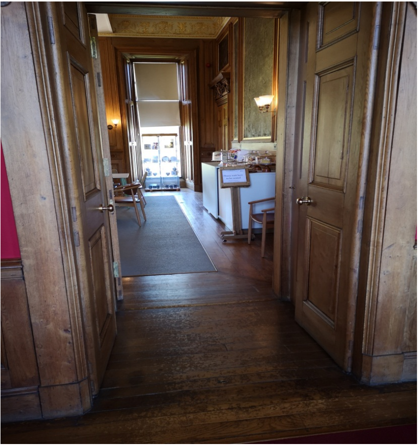
Entrance to the tearoom