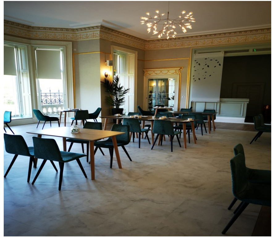
Afternoon tea in the Drawing Room