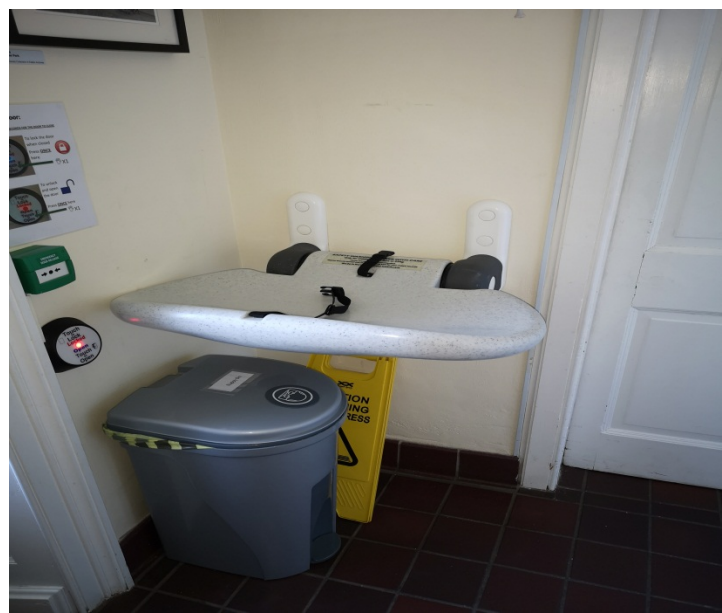
Baby changing facilities within the Accessible Toliet